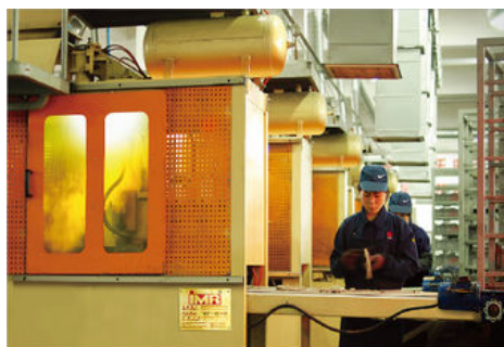
CAPTION FOUNDRY 铸造车间

Water meters and couplings Valves and fittings OEM Brass/Bronze/ Lead free parts ETP Copper Bus bar Brass/Bronze/ Lead free Ingots Brass/Bronze/ Lead free Rods Brass/Bronze/ Copper Coils/Strips Brass/Bronze/ Copper Sheets/Plates